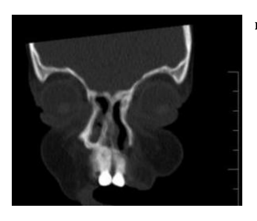
Fig-2-CT scan showing bifid nose with obliteration of right nasal cavity