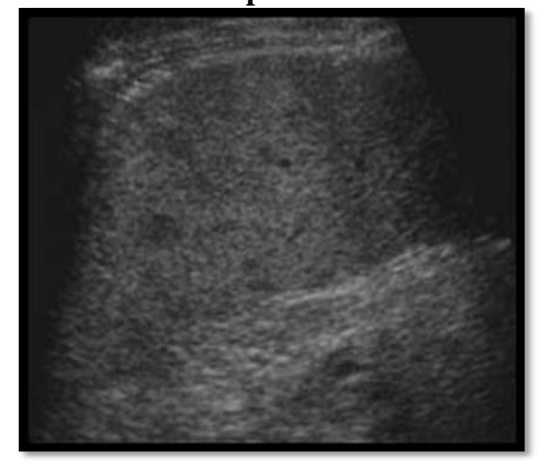
Fig 1a :Multiple hypoechoeic lesion in spleen