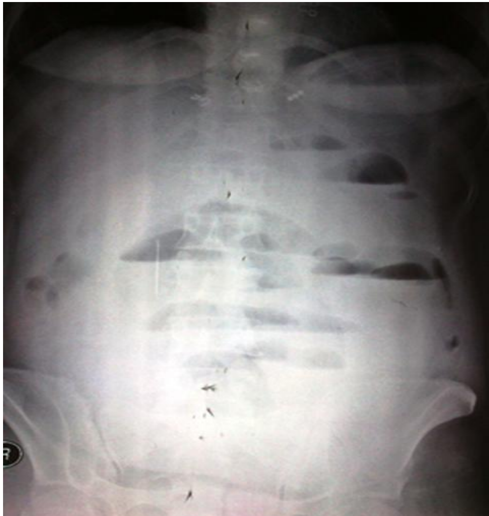
Figure 1: X- ray abdomen erect

On investigation, x-ray abdomen erect showed multiple air fluid levels restricted to the midline and to the left (Fig 1). She was managed with provisional diagnosis of acute intestinal obstruction keeping her NPO, with IV fluids and NG aspiration and was planned for emergency exploratory laparotomy.