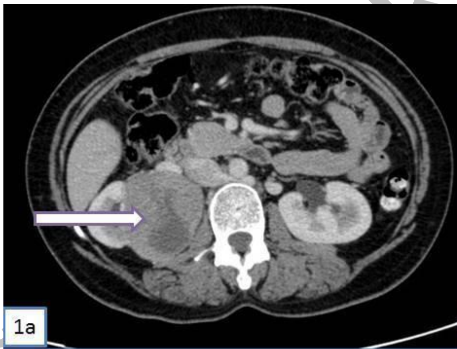
Figure No. 1a: CECT Abdomen: Well defined heterogeneously enhancing mass (pre-contrast HU42, post contrast HU61) seen in the superior pole of right kidney.

fever. On imaging (CECT Abdomen) the patient was detected to have well defined heterogeneously enhancing mass (precontrast HU42, post contrast HU61) seen in the superior pole of right kidney measuring 7.2x6.3x7.5 cm (Figure No. 1a).