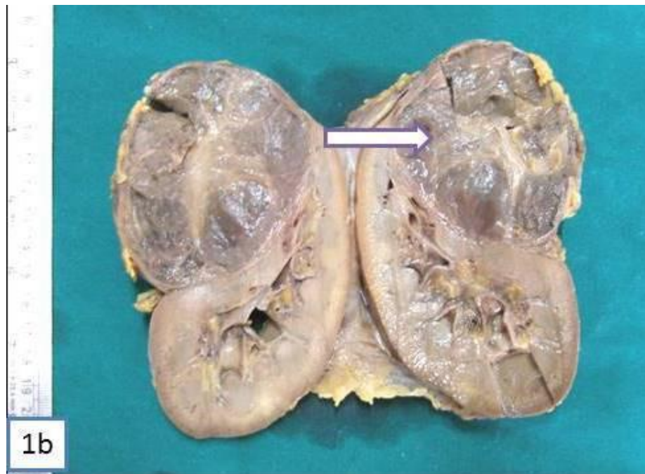
Figure No. 1b: Grey coloured tumour in the superior pole kidney with areas of necrosis

superior pole of kidney measured 8x7 x6.5 cm extending into hilum (Figure No. 1b).