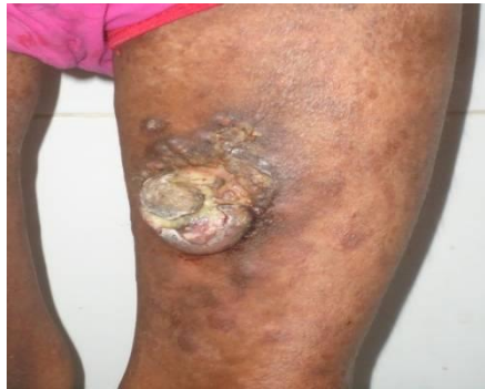
Figure 2: Ulcero-proliferative lesion with a raised everted keratotic edge, surrounding skin is lichenified and pigmented.

The histopathological examination of the ulcer biopsy confirmed diagnosis of well differentiated squamous cell carcinoma with atypical squamous epithelium and keratinization (Figure 3).