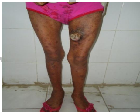
Figure 1: Cutaneous lichen planus on the medial aspect of left thigh.

On examination multiple raised pigmented verrucous plaques on thighs, dorsum, shins and ankles of both her legs, flexural areas of the wrists, the elbows, neck, chest and back were found with areas of depigmentation in some lesions. An ulcero-proliferative lesion measuring approximately 6cms x 5cms x 2cms was present on the medial aspect of her left thigh (Figure 1).