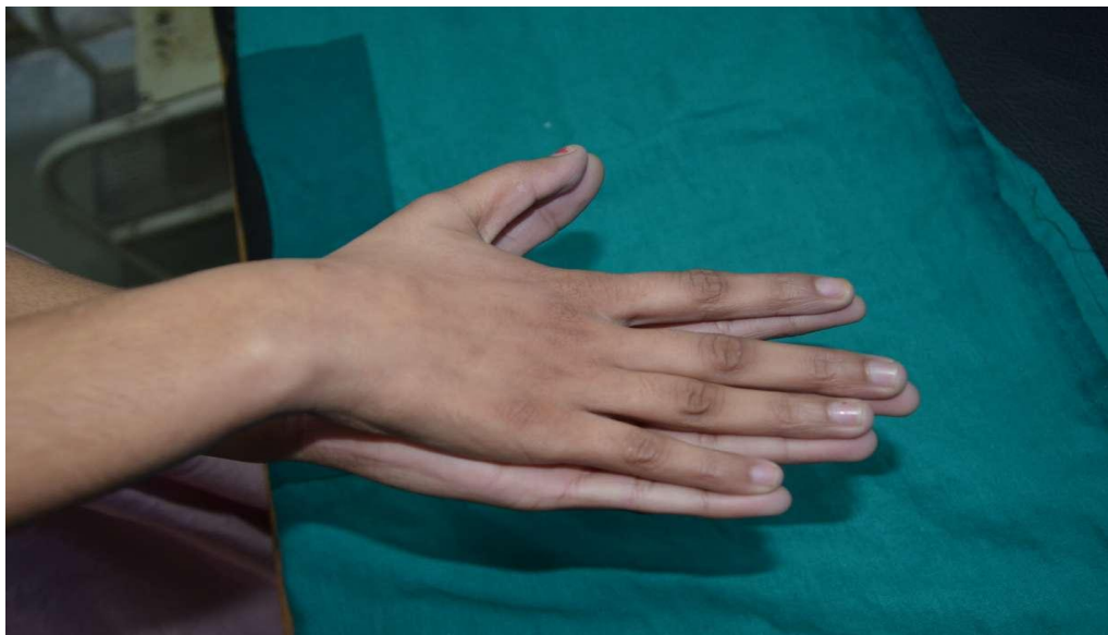
Figure 1 Both hands of the patient showing wasting and discrepancy in the size of right hand (upper one )

8 years. Right sided limbs showed significant wasting with grade 4 power. She had an extensor plantar with hemiplegic gait. She also demonstrated limb length discrepancy in right upper and lower limbs (Figure 1).