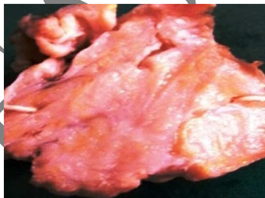
Figure1:- Gross specimen of Plexiform neurofibroma

Gross specimen (Figure1) was unencapsulated, nodular, and white to grey in colour. On cut –cremish-white in colour.