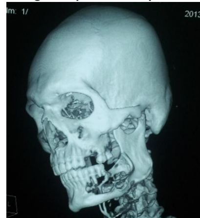
Figure 4: 3D reconstruction of the mandible showing multiple areas of perforation

The radiographic findings were strongly in support of segmental resection, so segmental resection of the left mandible was done and specimen was submitted for histopathology [Fig5]. Histopathological diagnosis was Unicystic ameloblastoma – mural variant.