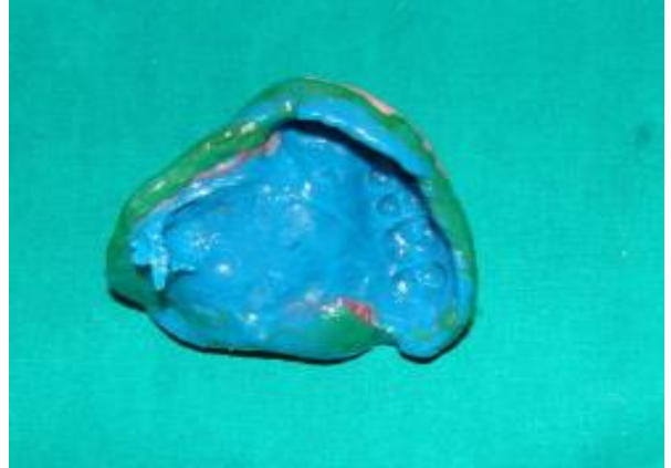
Figure 4: Final Impression

The impression was boxed and the master cast was poured in type IV dental stone. The denture base was fabricated with self cure resin and occlusal rims were made to record the jaw relation. After selecting the teeth, denture try-in was performed in the conventional manner, as in the complete denture construction. After verification of the jaw relation, the trial denture was sent to the lab for prosthesis fabrication. A closed type flexible obturator was processed in injection system with Luciton FRS (F.D). For better retention buccal extension on right side was given (fig 5).