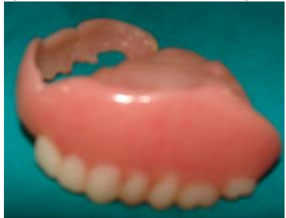
Figure 5- Final Prosthesis with buccal flange

The final prosthesis was inserted into the patient's mouth (fig 6) and it was checked for proper palatal contour and peripheral seal. The patient was educated about the maintenance of the prosthesis and was recalled for regular post-insertion visits. Adequate retention, stability and support were observed on subsequent recalls. The patient's normal swallowing ability was restored by the prosthesis and he was pleased with the dramatic improvement of speech and retention of the prosthesis.