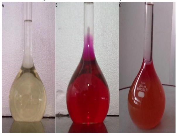
Figure 1: Changes In The Appearance Of The Reaction Mixture During The Production Of Complex Cross-Linked Polyamines.

(A) At the beginning of the reaction. Note the methanol layer in the neck of the flask to facilitate anaerobic incubation. (B) After one hour- cross linking in progress and the reaction mixture turns red. (C) Cross-linked polyamines-after 20 hours at 40°C. Some yellow-white precipitates at the bottom, an opalescent yellowish lower portion, orange middle portion, reddish top portion and clear methanol above that.