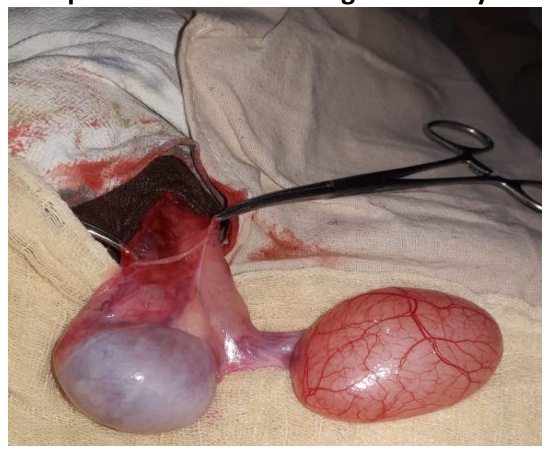
Figure 3: Intra-Operative Image Showing Left Giant Spermatocele Mimicking Accessory Testis

Microscopic examination of the fluid disclosed numerous spermatozoa, most of which were immobile. Histopathologic examination of the specimen revealed cyst lined by cuboidal to columnar epithelium with few spermatozoa in lumen and fibro-collagenous wall of cyst features suggesting Spermatocele (Figure 4).