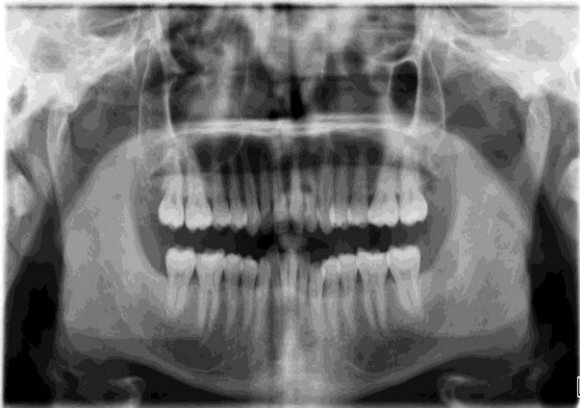
Figure 3: Sharp radiopaque line of lamina dura

At 1, 3 and 6 months of the follow-up, the alveolar socket appeared to be filled with uniform radiodense bone like tissue indicated that the socket healed fully with new bone. In addition, lamina dura of the socket disappeared completely by bone remodeling. Gradual absorption of the demineralised granules was observed on the sequential radiographic findings of the socket [Figure 4] and [Figure 5].