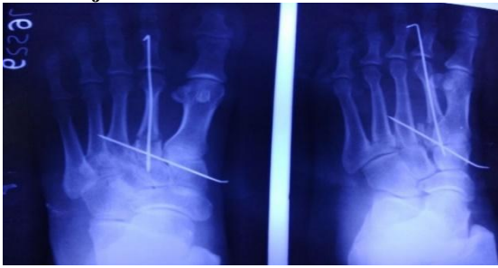
Fig. 3: Post op of case no. 13

Diagnosis was made from the x-ray by remembering the Stein's 14 normal x-ray guideline: (a) The first metatarsal aligns itself with the medial cuneiform both medially and laterally. This is evident on both AP and internal oblique views. (b) The first intermetatarsal space corresponds precisely with the first intertarsal space on both AP and internal oblique views. (c) The medial border of the second metatarsal aligns itself exactly with the medial edge of the middle cuneiform. This is best seen on the AP view. (d) The second intermetatarsal space aligns itself precisely with the corresponding intertarsal space between the middle and lateral cuneiforms. This relationship is best appreciated on the internal oblique view. (e) The third