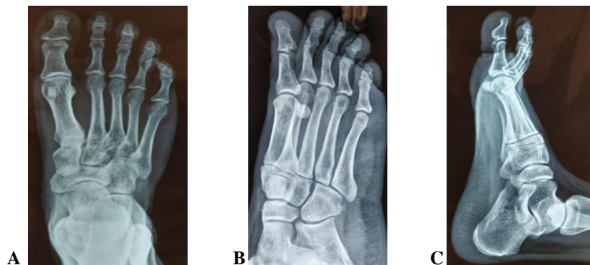
Fig. 4:(a) AP, (b) oblique and (c) Lateral View of normal foot alignment

intermetatarsal space is continuous with the corresponding intertarsal space between the lateral cuneiform and cuboid, and the lateral border of the third metatarsal aligns itself to the lateral edge of the lateral cuneiform. This is seen best on the internal oblique view. (f) The medial border of the fourth metatarsal forms a continuous straight line with the medial edge of the cuboid. This is best appreciated on the internal oblique view. (g) The relationship of the fifth metatarsal to the cuboid varies and cannot be relied on to diagnose a tarsometatarsal injury. However, the fourth and fifth metatarsals almost always move as a unit, allowing the alignment of the fourth tarsometatarsal joint to be used as a marker for displacement of the fifth metatarsal. (h) On the lateral view, evaluation of the tarsometatarsal joints, specifically the important second tarsometatarsal, should demonstrate an uninterrupted line along the dorsal surface of the tarsal bone proximally and the corresponding metatarsal base distally. Any dorsal displacement of the metatarsals is abnormal and indicates a significant Lisfranc injury with instability. Slight plantar displacement of 1 mm or less, however, may be a normal radiographic finding. Overlap of bone structures can cause difficulty with interpretation of this view (Fig. 4). 14