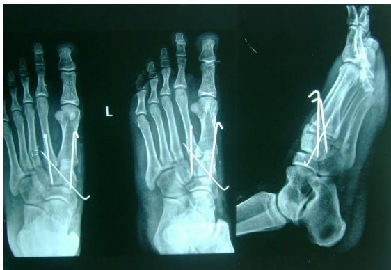
Fig. 9: Post operative case no. 9 at 6 weeks

Operative treatment of closed injuries was delayed until soft-tissue edema subsided, which usually occurred within two weeks, unless there were increased compartment pressures and urgent fasciotomy was done. Operative reduction and fixation proceeded from a medial to a lateral direction. The first and second tarsometatarsal joints were approached through a single dorsal incision over the first intermetatarsal space. The branches of the superficial and deep peroneal nerves and the dorsalis pedis artery were preserved, and the first and second metatarsocuneiform joints were opened and irrigated. Comminuted fragments were reduced when possible; smaller, irreducible fragments were removed. The first tarsometatarsal joint was aligned by reducing the medial border of the medial cuneiform to the medial border of the first metatarsal. The plantar-medial aspect of the joint was directly visualized to ensure that there was no plantar gap. The joint was held reduced with a provisional Kirschner wire, and then threaded 2.5/3 mm K-wire or if necessary then 3.5mm countersunk screw was inserted from the metatarsal base proximally into the medial cuneiform, with care being taken to avoid violating the adjacent naviculocuneiform joint.