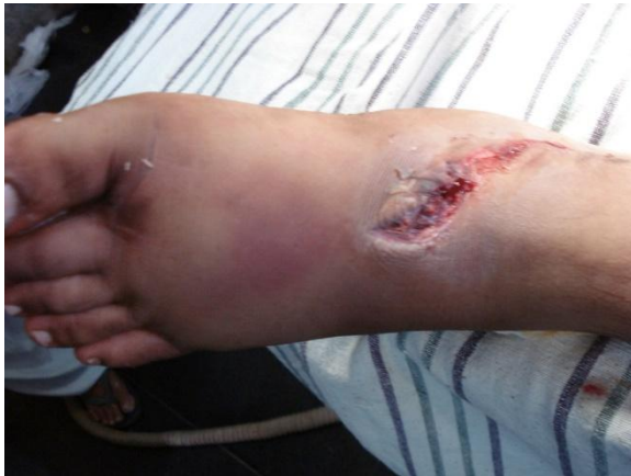
Fig. 7: case no.9 having open area that required coverage later on

13 patients had involvement of all five tarso-metatarsal joints, none had involvement of four, 3 had involvement of three, and 5 had involvement of two. 3 injuries involved the medial column (the first and second tarso-metatarsal joints) alone, and 2 involved the lateral column (the fourth and fifth tarso-metatarsal joints) alone. 4 patients required fasciotomy because of impending compartment syndrome of the foot. 14 had fractures of the bases of the metatarsals. 6 patients had associated cuneiform fractures or disruptions, and 4 had associated cuboid fracture. 15 patients had combined ligamentous and osseous injuries, and 5 had ligamentous injury only (no fracture). Patients with only a fleck sign 4 (an avulsion fracture of the Lisfranc ligament 17 ) were considered to have purely ligamentous injury. The direction of displacement was lateral in 14 patients, medial in 2, and divergent in 4. For 2 patients, the diagnosis was delayed for more than one month. Final radiographs were reviewed for evidence of fracture nonunion, malalignment, posttraumatic osteoarthritis, or implant failure.