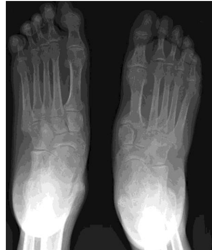
Fig. 8: case no. 4 who developed arthritis within 1 year

13 patients had involvement of all five tarso-metatarsal joints, none had involvement of four, 3 had involvement of three, and 5 had involvement of two. 3 injuries involved the medial column (the first and second tarso-metatarsal joints) alone, and 2 involved the lateral column (the fourth and fifth tarso-metatarsal joints) alone. 4 patients required fasciotomy because of impending compartment syndrome of the foot. 14 had fractures of the bases of the metatarsals. 6 patients had associated cuneiform fractures or disruptions, and 4 had associated cuboid fracture. 15 patients had combined ligamentous and osseous injuries, and 5 had ligamentous injury only (no fracture). Patients with only a fleck sign 4 (an avulsion fracture of the Lisfranc ligament 17 ) were considered to have purely ligamentous injury. The direction of displacement was lateral in 14 patients, medial in 2, and divergent in 4. For 2 patients, the diagnosis was delayed for more than one month. Final radiographs were reviewed for evidence of fracture nonunion, malalignment, posttraumatic osteoarthritis, or implant failure.