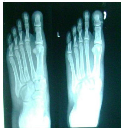
Fig. 1: Case no.1 without any fracture involvement of all 5 Tarso-metatarsal joints

We performed a retrospective study of all patients with a tarso-metatarsal joint injury treated at V. S. general hospital and associate hospitals between 2010 and 2013. The study was conducted with the approval of ethics committee of the institution and prior consent of patients was taken. Inclusion criteria were skeletal maturity and open reduction and internal fixation of a Lisfranc joint injury. Indications for surgery were instability, displacement of at least 1 mm in any plane, and purely ligamentous injury.