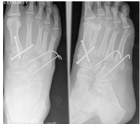
Fig. 10: Postoperative photograph at 6 weeks of case no.1

If instability persisted, an additional K-wire or 3.5-millimeter screw was placed from proximal to distal and lateral to the first screw to add rotational stability. The second metatarsal was then reduced to the medial border of the middle cuneiform and was held provisionally with a Kirschner wire.