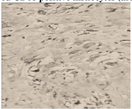
Figure 4: Anti-CD68 immunohistochemical staining of tumour tissue. Tumour cells showed CD68 positive histocytes (arrow).