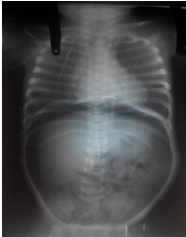
Figure 2: X-ray after Gastric perforation showing pneumoperitonium

The patient was shifted for laparotomy findings were pneumoperitonium and sealed gastric perforation in the anterior wall of prepyloric region of stomach (Figure.3), which was closed with