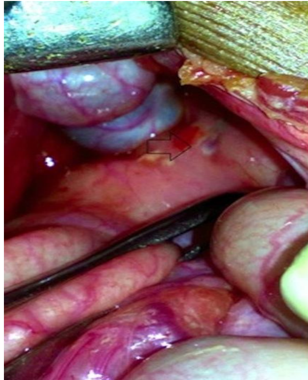
Figure 3: Intra-operative picture - Arrow showing sealed gastric perforation