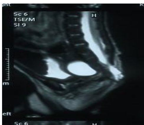
Figure 3: Saggital T2 W MRI showing meningocele with tethering of cord