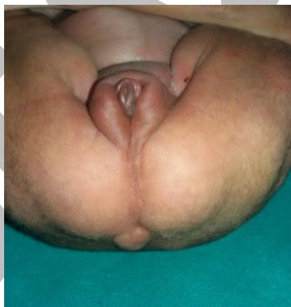
Figure 1: Newborn showing imperforate anus and sacral swelling

On clinical examination, there was no anal opening and a hypertrophied clitoris with prominent hooded appearance was present. A swelling of 3 cm diameter was also present in lumbosacral region. Patient was moving lower limbs and there was no urinary incontinence. There was neither facial dysmorphism nor any limb deformities were present. Patient was normally feeding and was passing urine and stool through a single opening.