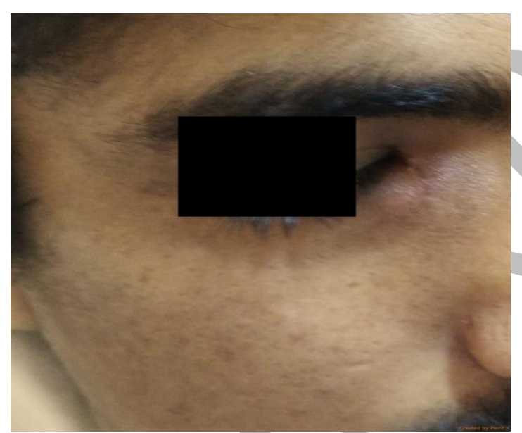
Figure 1: Right medial canthus swelling

referred to our institution. Clinical examination revealed a 2 x 2 cm hard mass at the inner canthus of the right eye with excessive lacrimation (Figure 1).