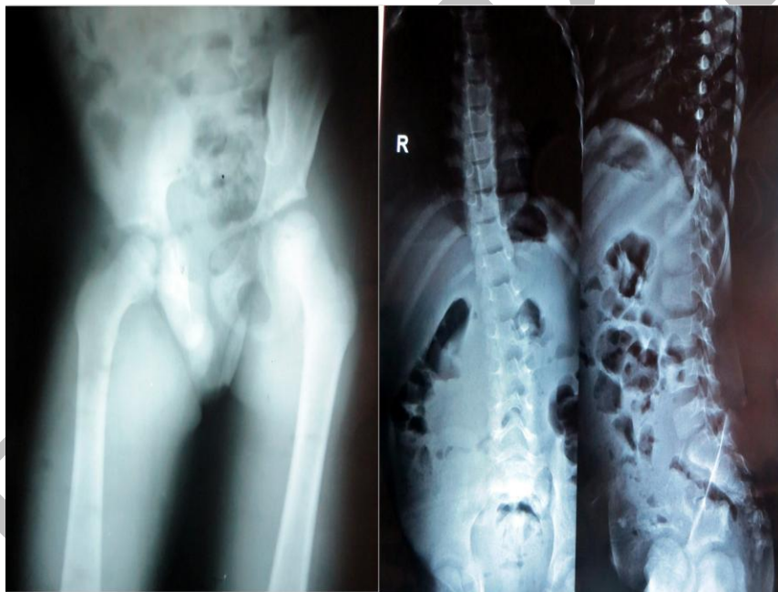
Figure 1: Skiagram showing hip flexion deformity and unremarkable spine abnormality

the rest and supportive, symptomatic treatment. The child was put on bed rest and pain relieving medications. Skin traction on the affected extremity was placed with one brick of weight with appropriate counter-traction in view of the flexion deformity correction. Traction was also intended to relieve muscle spasm and pain. (Figure1)