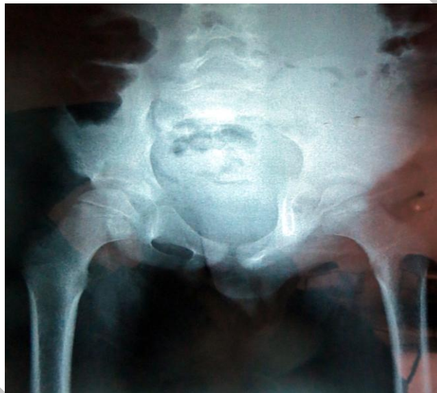
Figure 4: Corrected flexion deformity after the treatment.

treatment. The flexion deformity was relieved on post operative radiographic evaluation.(Fig.4) The incision healed uneventful and child was pain-free and performing activities of daily living when reviewed in periodic follow up bimonthly and finally after a year.