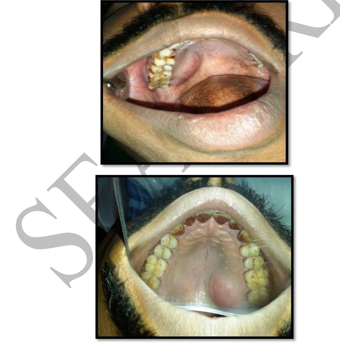
Figure 2- Intra oral picture of swelling in relation to 15, 16, 17

soft to firm in consistency, immobile, compressible and did not show any fluctuation or pus discharge. The swelling did not cross the midline. Teeth associated with the swelling showed evidence of stains and grade II mobility calculus. There was no and displacement associated with the teeth.