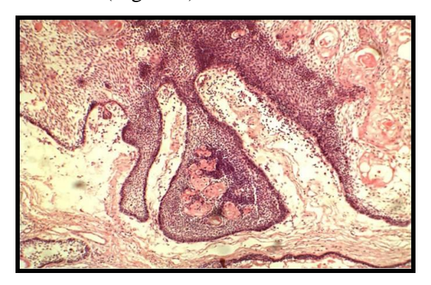
Figure 6 : The presence of ghost cells in the ameloblastomatous epithelial islands The follicles had peripheral ameloblast- like cells and central stellate reticulum- like cells. Ghost cells were seen in most of the large follicles (Figure 7).

Budding from the basal layer into the adjacent connective tissue, strands of odontogenic epithelium and follicles were seen (Figure 6).