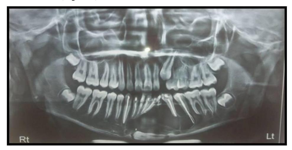
Figure 4: Orthopantamograph showed well defined multilocular radiolucency with radio-opaque flecks extending from lower right canine to lower left first molar. Impacted 33, displaced root of lower anteriors and RCT in relation with 41, 42, 43, 31, 32, 34, 35.

Radiographic examination disclosed a multilocular radiolucency with radio-opaque flecks. Impacted 33, displacement of roots of 31,32, 41, 42 and RCT in relation with 41, 42, 43, 31, 32, 34, 35 were noticed (Figure 4).