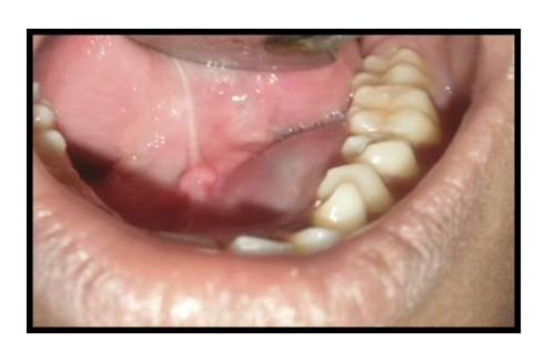
Figure 2: Intrabony swelling on left lingual side of the mandible.

The swelling was approximately 3X1 cms in size (Figure 2). There was displacement of 31 and 32 (Figure 3).