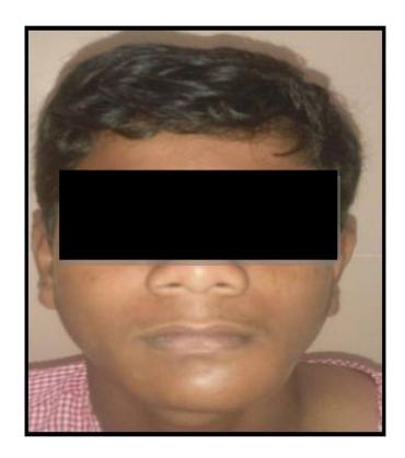
Figure 1: Diffuse extraoral swelling of mandible on the left side of mandible.

Extra orally, the swelling extended from symphysis to left body of mandible (Figure 1). On palpation the swelling was firm and tender. There was no associated lymphadenopathy.