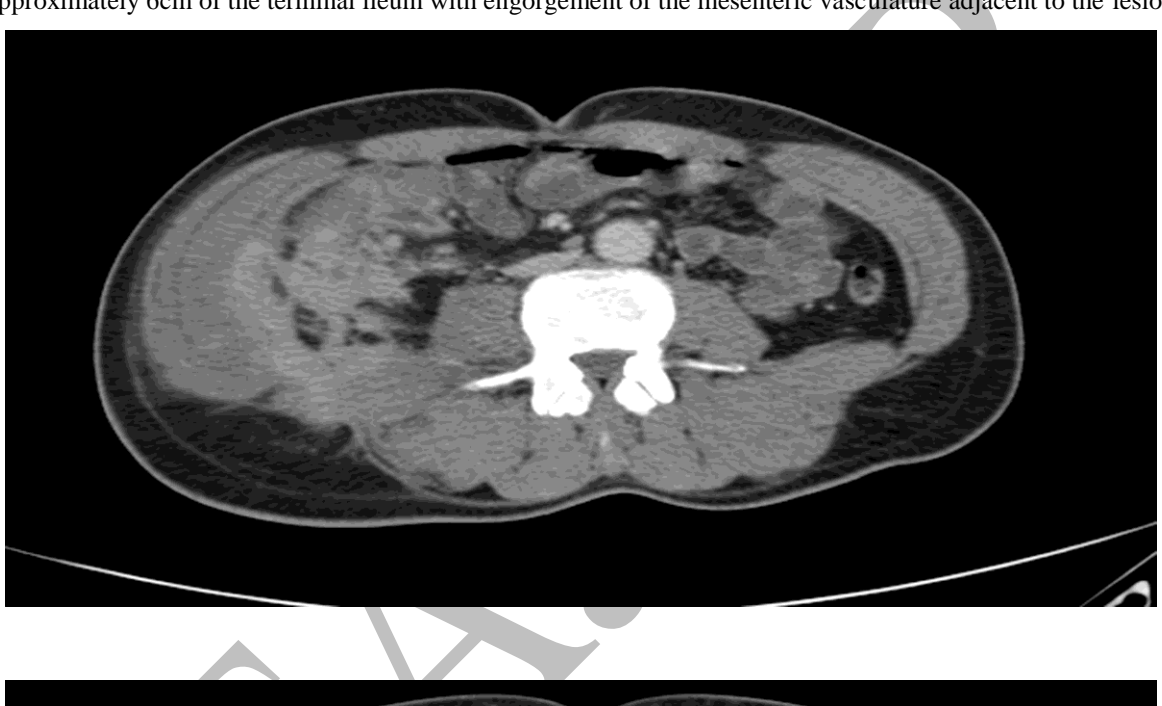
Figure 1(A): Contrast enhanced Computed tomography of the abdomen showed a heterogeneously enhancing irregular circumferential wall thickening involving the caecum, proximal ascending colon, ileocaecal junction and approximately 6cm of the terminal ileum with engorgement of the mesenteric vasculature adjacent to the lesion

abdominis and internal oblique muscles along the lateral abdominal wall, quadratus lumborum posteriorly and into the iliopsoas muscle posteromedially (Figure 1 A and B). CECT findings were suggestive of malignancy of the caecum.