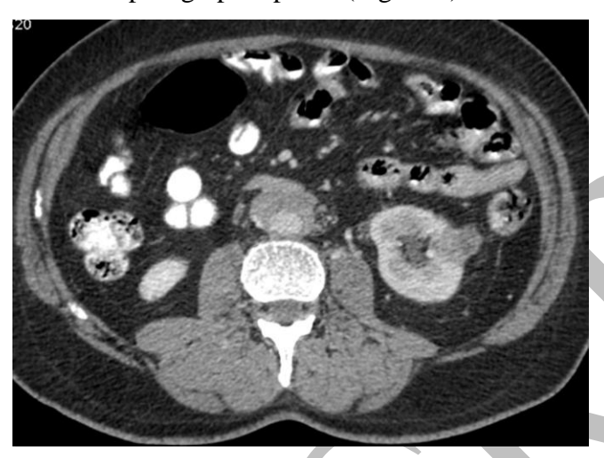
Figure 3 Nephrographic phase coronal image shows persistence of enhancement of the left renal mass which is predominantly eccentric. Retroperitoneal fibrosis around the aorta is also seen.

The enhancement persisted in nephrographic phase (Figure 3).