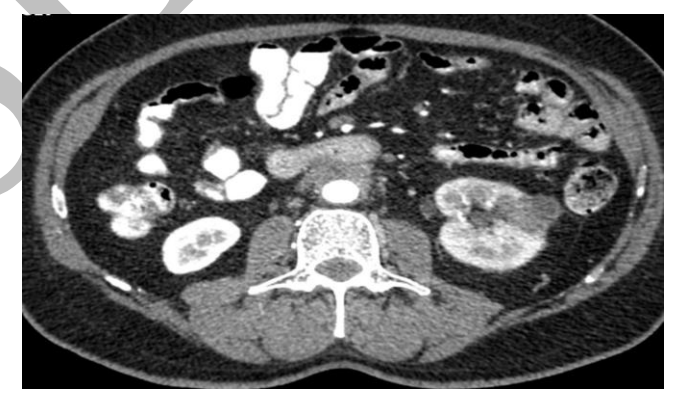
Figure 2 Corticomedullary phase axial image shows heterogeneous enhancement of the mass. Adjacent fat shows stranding indicating the extension of the pathological process into the pararenal fat.