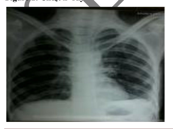
Figure 1: Chest x- ray

Chest X ray showing left costophrenic angle blunt with left hilar prominence with calcification