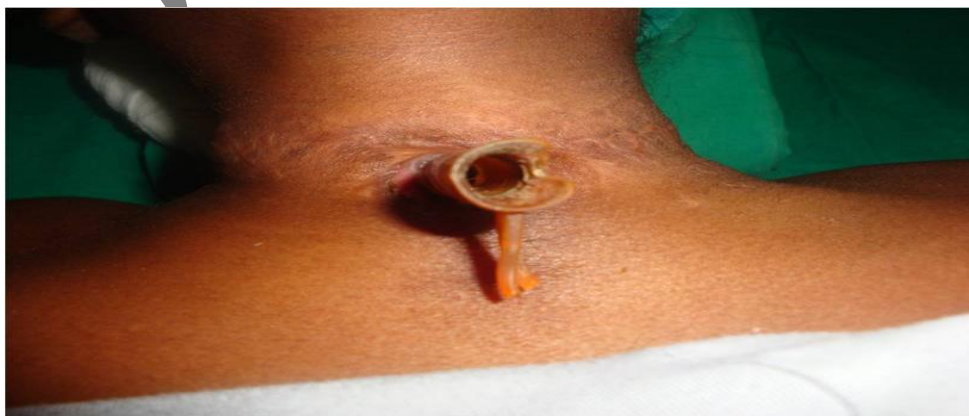
Figure 3: Showing the T- tube in-situ in the second patient 9 years after initial implantation

years back. She was lost for follow up. At presentation, she was in stridor. Conducted sounds were heard in both lung fields. Examination of the neck showed a brown corroded horizontal limb of the T-tube jutting out of the tracheostoma. Flexible endoscopy was tried but showed a dry crust in the tube which was hard. T- tube was removed (Figure 3).