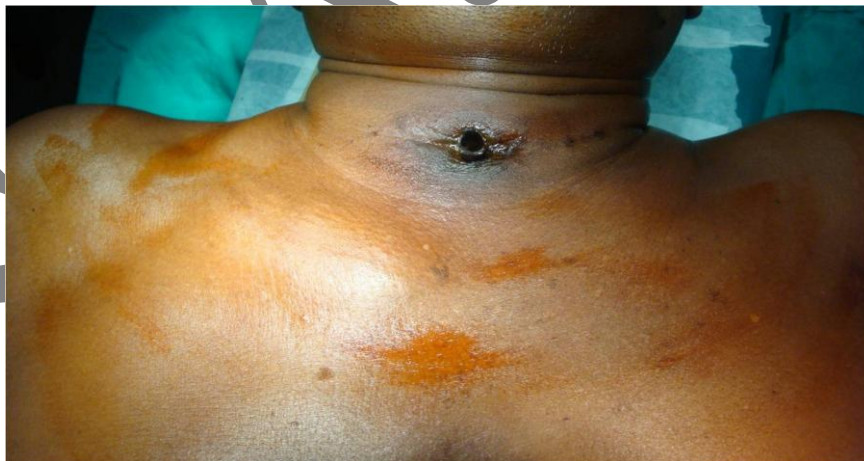
Figure 1: Showing the 'almost buried' T tube insitu at presentation, in the first patient 11 years after implantation.

Flexible laryngoscopy and flexible tracheobronchoscopy through the T- tube showed no significant abnormality in the rest of the traheobroncheal tree. Under monitored anaesthetic care, we removed