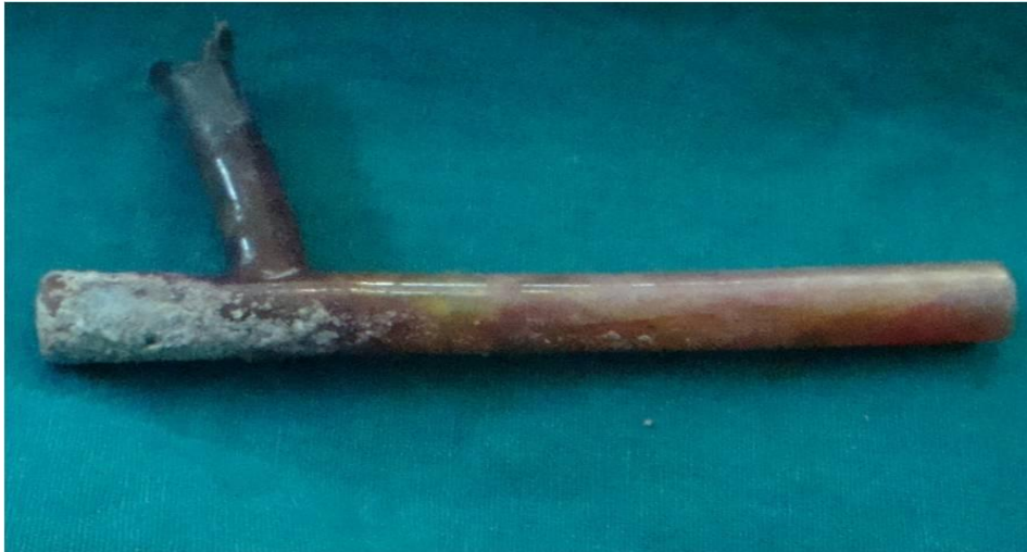
Figure 2: The T tube after removal. Note the change in colour, corrosion of the horizontal limb and the crusting 'biofilm' at the upper end of the tube.

is phonating well with no respiratory distress at 2 year follow up.