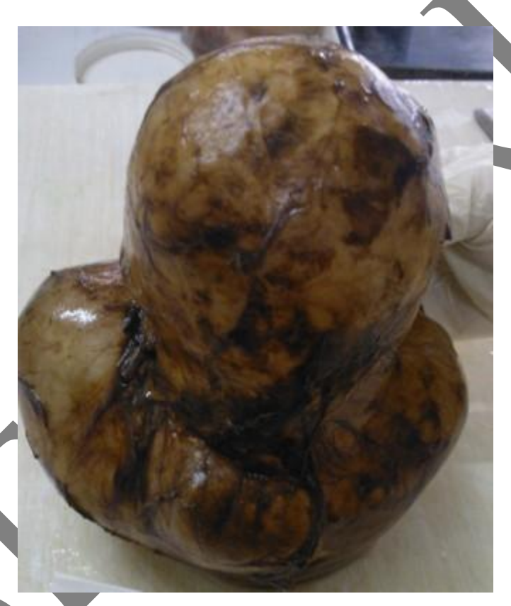
Figure 3: Gross photograph of mesenteric hydatid cyst.

<u>Case 4 -</u> A thirty five yrs old female presented to the gynecology department with history of menorrhagia for 1 year and spasmodic abdominal pain for 6 months. On abdominal examination a cystic mass