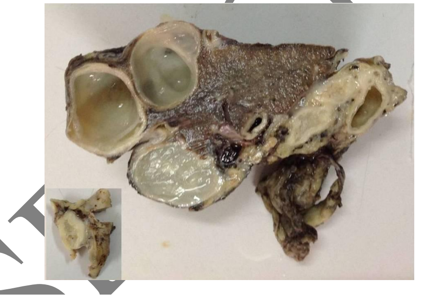
Figure 5: Gross photograph showing multiple hydatid cysts in the spleen. Inset in lower left corner shows hydatid cyst in the appendix of the same patient.

contents of the liver hydatid cysts were aspirated and daughter cysts removed, and the cavity was irrigated. The specimens were sent for histopathology. The spleen showed multiple hydatid cysts the largest measuring 3.5 x 2.5 cm. The appendix showed a thick walled cyst in its wall and in the mesoappendix measuring 2.5 x 2 cms. Histopathology confirmed the splenic and appendiceal hydatid cysts. (Figure 5)