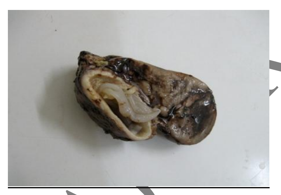
Figure 2: Gross photograph showing hydatid cyst in the kidney

[Figure 2] which was also confirmed on histopathology.