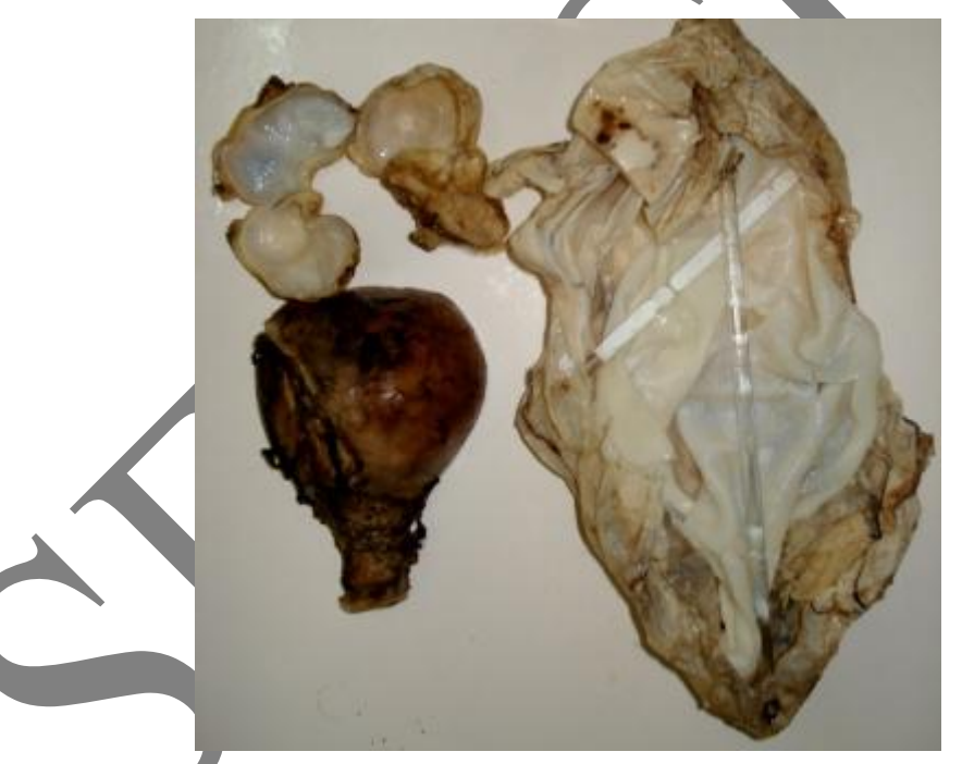
Figure 4: Gross photograph showing bilateral hydatid cysts in the ovaries

pelvic region along with a small intra peritoneal cyst and 2 cysts in the liver. The contents of the liver hydatid cysts were aspirated and removed, and the cavity was irrigated. Total abdominal hysterectomy with bilateral salpingo-oophrectomy and removal of the small intra peritoneal cyst was done. Histopathology confirmed bilateral ovarian hydatid cysts with a fibroid uterus. (Figure 4)