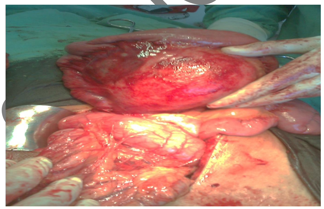
Figure 1 Large fibroid twisted around the mesentery

stomach (Figure 1 and 2). Finally excision of mesenteric mass with duodeno-jejunal resection anastomosis was done. Patient was discharged uneventfully on day 5. Biopsy revealed that morphology is consistent with diagnosis of fibromatosis (Desmoid) (Figure 3) of the mesentry. The tumor cells are negative for DOG1, Gastrointestinal Stromal Tumor (GIST), and S100. Sections given from intestine are unremarkable.