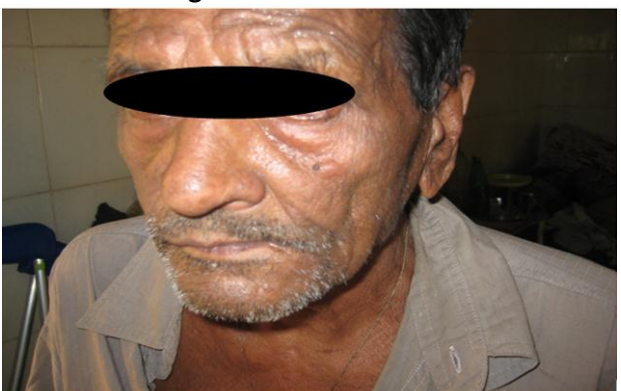
Figure1: Nodular lesion