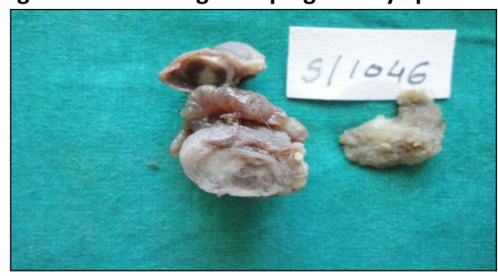
Figure 1: Partial Right Salpingectomy Specimen

Microscopic examination showed multiple noncaseating epithelioid cell granulomas occasional degenerated chorionic villous along with decidual tissue, thus confirming tubal ectopic pregnancy with tuberculous salpingitis.