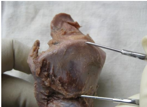
Figure 2: Measurement Of Height Of Thyroid Lamina

The width of the lamina was similarly measured on both sides as shown in Figure 3