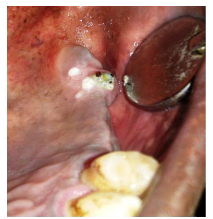
Figure 2: Intra oral small multiple papillary/Verrucous growths present on palatal gingiva

In both the cases there was neither tenderness nor bleeding on palpation of the lesion. No similar lesions were noted elsewhere in body. Both the cases were exposed to surgical excision under proper aseptic precautions & local anesthesia. Excised specimen was sent for histopathological revealed examination, which hyper orthokeratinized stratified squamous epithelium thrown into small papillary projections supported by thin connective tissue cores. The epithelium was acanthotic with long rete pegs, and covered by thick layer of keratin, suggestive of Verruca Vulgaris