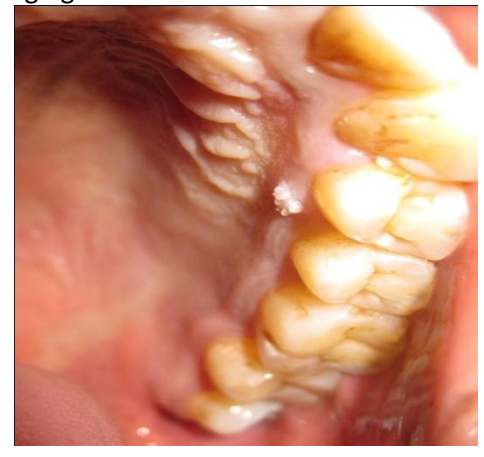
Case 2: A 55-year-old male reported to the outpatient department of oral medicine with complaint of replacement of his missing teeth. Intra oral examination revealed multiple small papillary sessile, painless keratotic growths present on palatal gingiva in relation to tooth #27