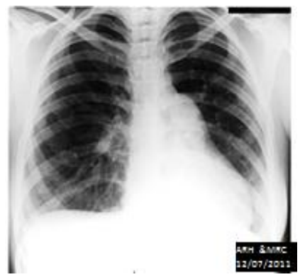
Fig-2 Prominent pulmonary vasculature with peripheral pruning, perihilar haze

ventricular systolic function with tricuspid regurgitation. Right ventricular end systolic pressure was 85 mm Hg which directly reflected the pulmonary arterial pressure. Left heart was normal. T. Bosentan 62.5mg BID was started by the cardiologist. We continuously administered Oxygen by ventimask at 6 l/min and non-invasively monitored her HR, ECG, RR, SPO<sub>2</sub>, urine output, foetal heart rate (till delivery of baby) since admission of patient and during post partum period also.