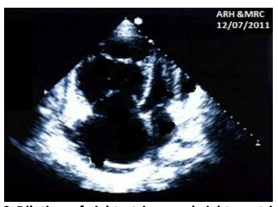
Fig-3 Dilation of right atrium and right ventricle, right ventricular end systolic pressure 85 mmHg, normal left ventricular function

2D Echo was done by cardiologist on admission, after epidural analgesia, post delivery of foetus, after 4hrs of delivery and before shifting from ICU to ward.