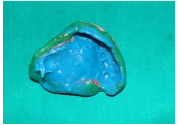
Figure 4: Final Impression

The impression was boxed and the master cast was poured in type IV dental stone. The denture base was fabricated with self cure resin and occusal rims were made to record the jaw relation. After selecting the teeth, denture try-in was performed in the conventional manner, as in the complete denture construction. After verification of the jaw relation, the trial denture was sent to the lab for prosthesis fabrication. A closed type flexible obturator was processed in injection system with Luciton FRS (F.D). For better retention buccal extension on right side was given (fig 5).