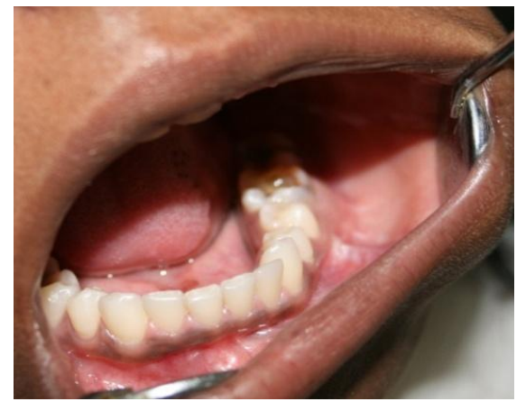
Fig 2: Intraoral Photograph Showing Buccal Vestibular Obliteration In Relation To 36.

Based on history and clinical examination periapical cyst in relation to 36 was given as provisional diagnosis and central gaint cell granuloma, ameloblastoma, benign cyst or tumor were considered for differential diagnosis.