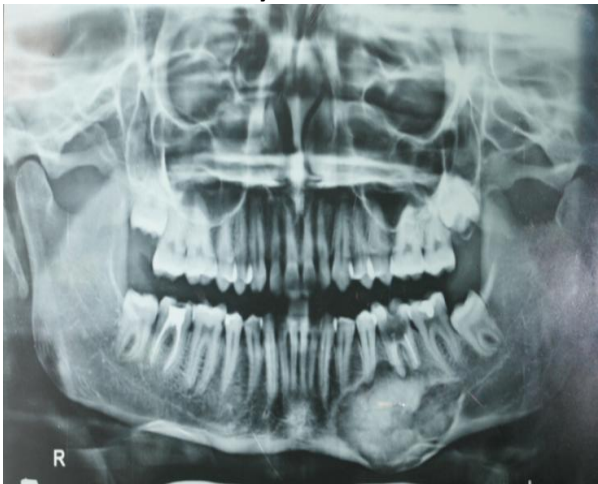
Fig 3: A Solitary Large Mixed Radiopaque And Radiolucent Lesion On Left Body Of Mandible Surrounded By Corticated Border.

Radiographic investigations were planned. Panoramic radiographs (Fig 3) revealed normal condylar morphology in relation to the articular eminence on both right and left side with normal bone pattern throughout the mandible. A solitary large mixed radiopaque and radiolucent lesion covering entire left body of mandible extending anteriorly till distal aspect of 33, posteriorly till mesial aspect of 37, superiorly reaching till alveolar process and inferiorly expanding inferior border of mandible surrounded by well defined corticated border. Mandibular Occlusal radiograph (Fig 4) revealed a solitary large mixed radiopaque and radiolucent lesion covering entire left body of mandible and buccolingual cortical plate expansion seen.