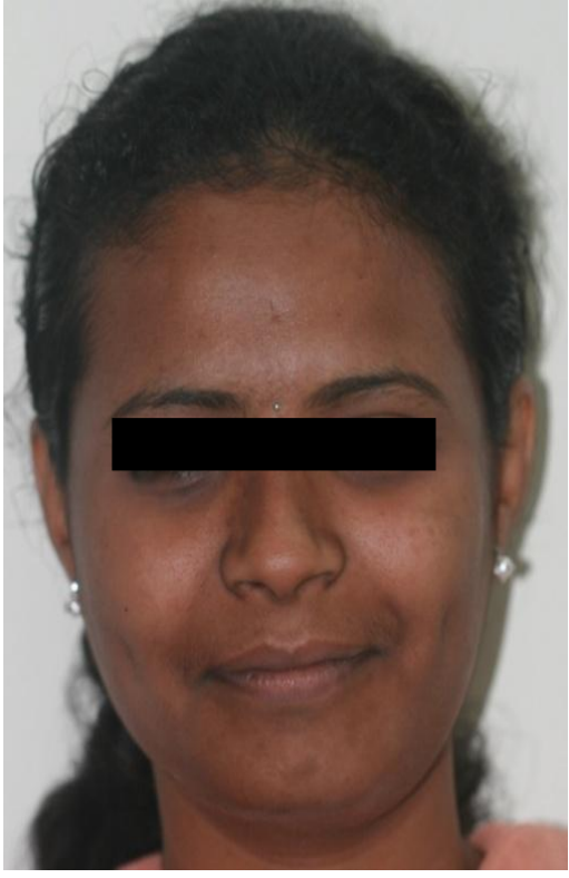
Fig 1: Extraoral Photograph Showing Diffuse Swelling On Left Side Of The Face

Lymph nodes were not palpable and there was no abnormality on temporomandibular joint examination. Intra-oral examination (Fig 2) revealed restoration with 37 and 47 and dental caries was seen with 36. There was no intra oral swelling seen but left buccal vestibular obliteration was palpated, suggestive of cortical plate expansion.