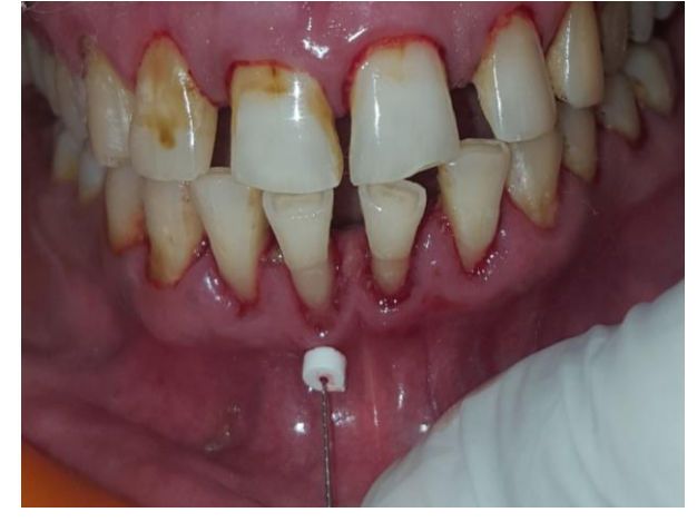
Figure 2- Transgingival Probing Method For Detection Of Gingival Biotype

Another method used was Probe Transparency (PT) method (Figure 3), in this method, the gingival biotype is considered thin if the outline of the probe is visible through the gingival margin from the sulcus or pocket.