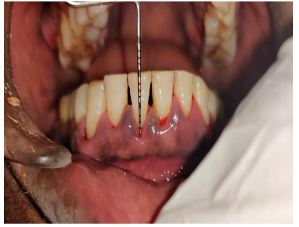
Figure 1-Measurement Of Recession Length

<u>Methods To Determine Gingival Thickness</u>: In the Transgingival probing (TP) method, after infiltration with local anesthetic solution, the gingival thickness was assessed midbuccally using an endodontic reamer (20 number) fitted with a rubber stopper as shown in (Figure-2) and measured on the ruler up to the nearest millimeter. This measurement was made halfway