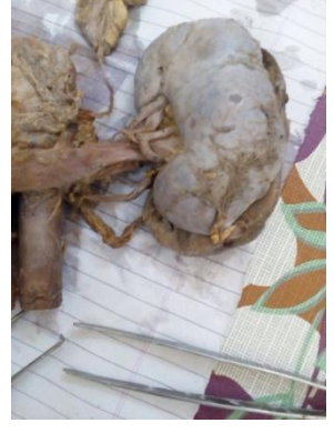
Fig-5: Superior Polar Artery Arising From The Main Renal Artery