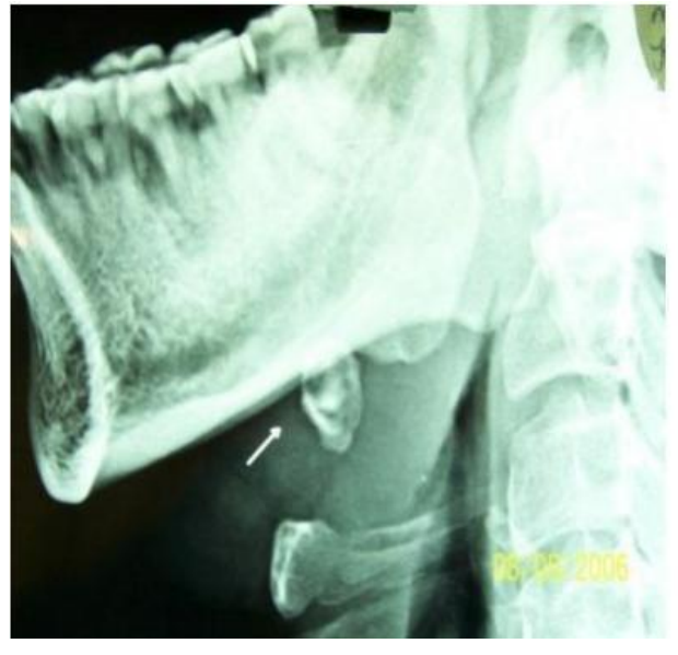
Figure 2. Calculi in Right Side Submandibular gland

Minor salivary glands pathologies are uncommon. In the study by Ronald et al^5 describing 5,539 (23%)