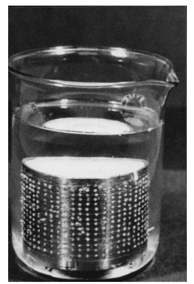
Fig. 3 Impression immersed in water

NJIRM 2012; Vol. 3(4). September - October