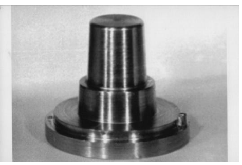
Fig. 1 Stainless steel die

recorded. Three readings were taken at three different reference points for the height (H) at A_1, A_2, A_3 diameter (D<sub>1</sub>) and Diameter (D<sub>2</sub>) for each of the stone die and mean was calculated. The volume of each stone die was calculated by applying formula stated above. Difference in volume between each of the stone die and master die was calculated and results were subjected to statistical analysis.