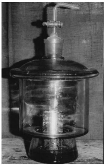
Fig. 4 Impression in humidor

Results: The results of the statistical analysis are shown in tables I, II, III, IV .